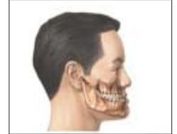
Patient with Underbite

Please note: Refer back to questions 1,2,8,9,10,11 & 12. If they are answered YES, please explain below. Also, describe any other medical problems not yet covered.